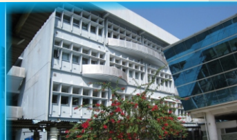
Meteorology & Oceanography