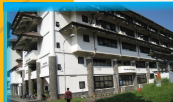
Geodesy & Geomatics